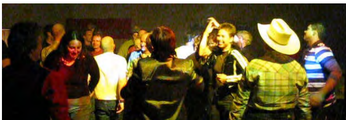
VOLUNTEER APPRECIATION DANCE