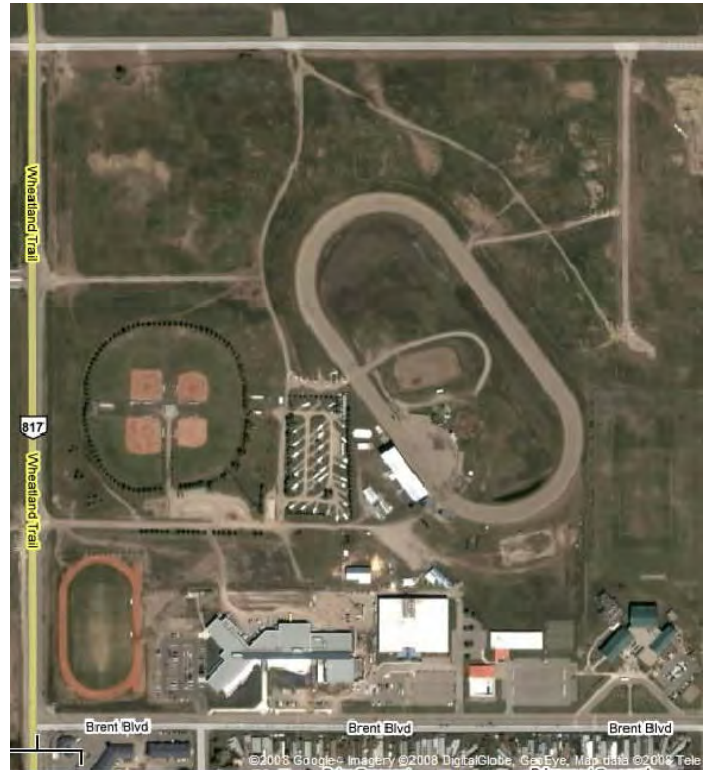
Strathmore Ag. Society Grounds

you can think of. Although there are no permanent barns on the grounds there are buildings that will accommodate the portable stalls again this year to allow our four-legged competitors a safe and secure resting area. A first for CRIR, and a bonus for the horse people, is that we now have a warm-up arena too!