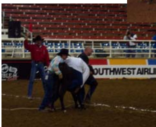
"Push RC, PUUUUUSH!"