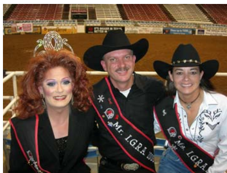
The 2006 IGRA Royalty Team