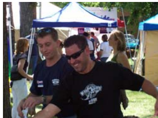
Is it hot in here???