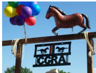
The crowning jewel of the float!