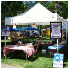
Pride in the Park in Fort Collins