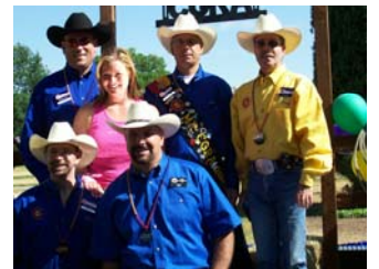
Stacy from Bud Light and the gang