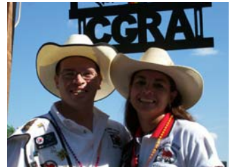
Some International Royalty