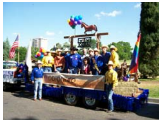
The whole she-bang