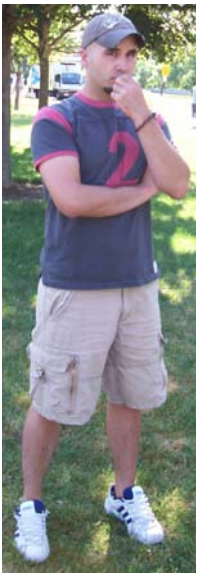
The float master deep in thought. Do I smell something burning?