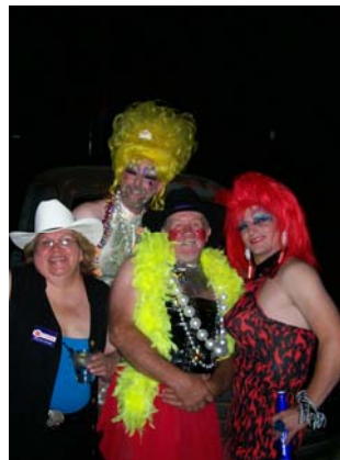
The "ladies" of the Bar Crawl