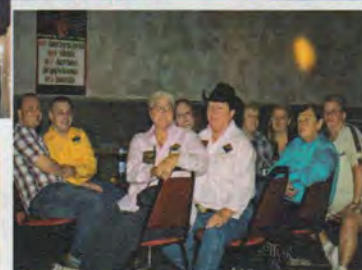
Part of the crowd that went to the after party - after the Competition. The new Royalty, went home exhausted.