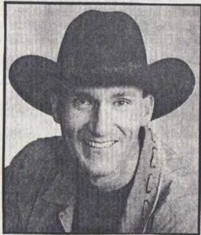
MR. GSGRA '97'

invites you to party till the cows cum home @ the Faultline Sunday Beer/Soda Bust October 12, 3pm-8pm 4216 Melrose (at Vermont) Bust $6