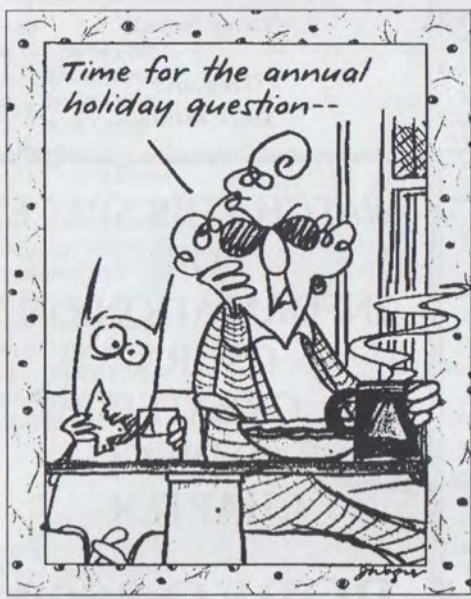
Does Fruitcake Flush?