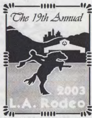
2003 Hat Pin Design