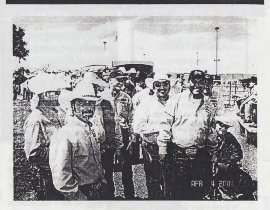
Just some of the Bay Area Chapter and GSGRA gang at the Big Horn Rodeo.