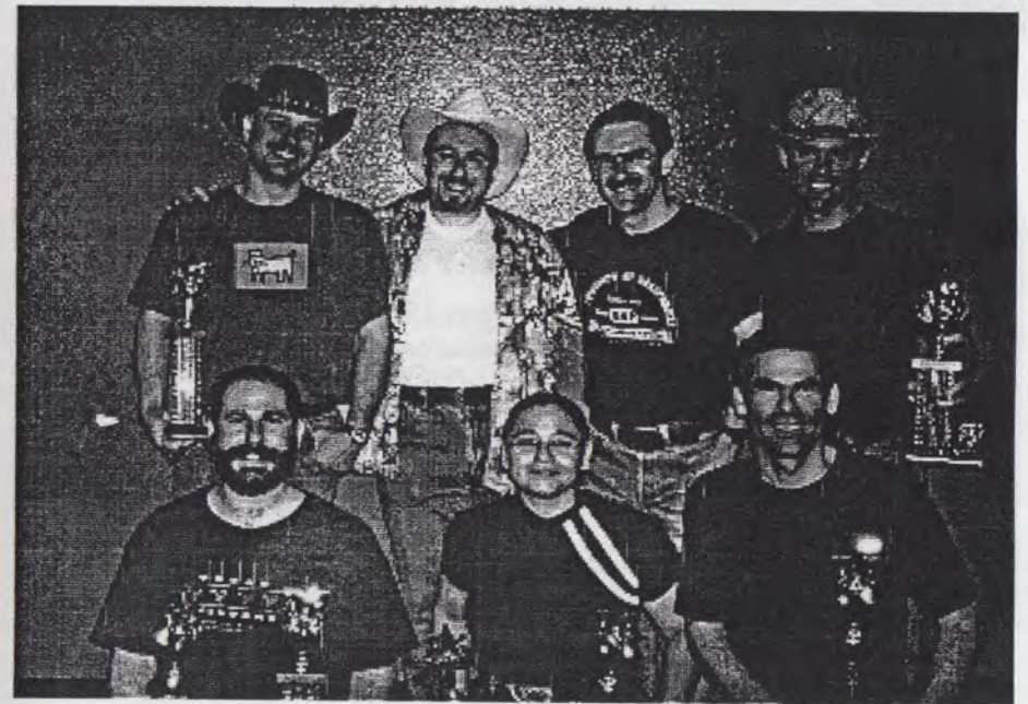
Here are the winners of the BAC line dance competition at the Sundance Saloon!