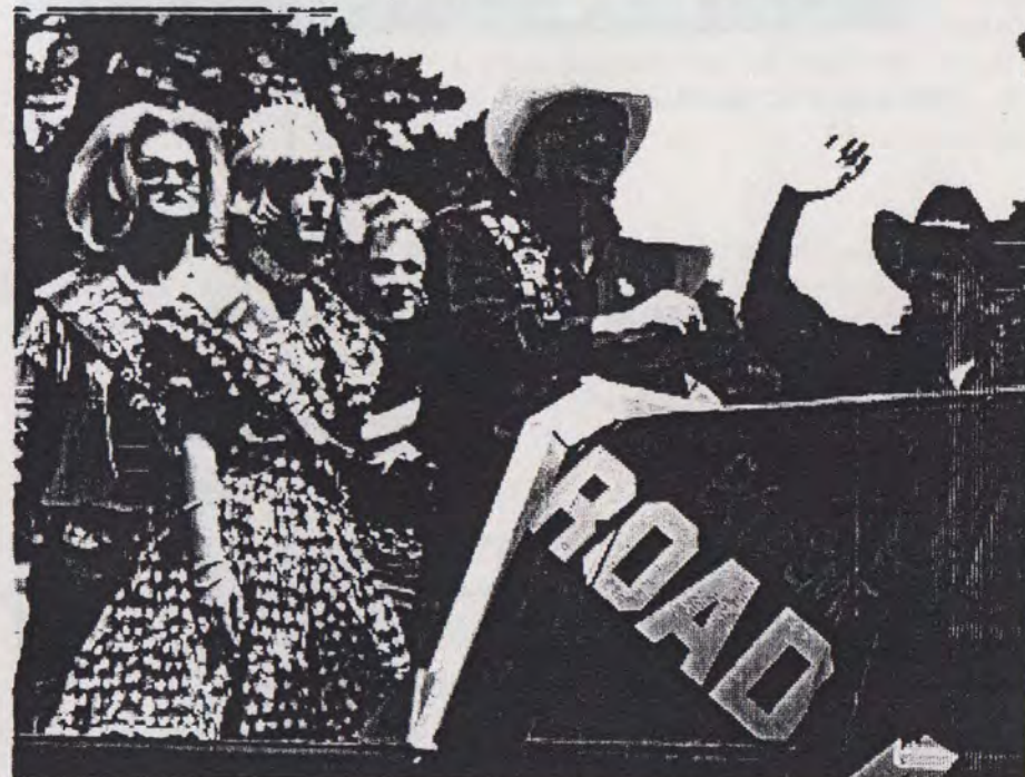
Chapter, State and IGRA Royalty during Grand Entry!