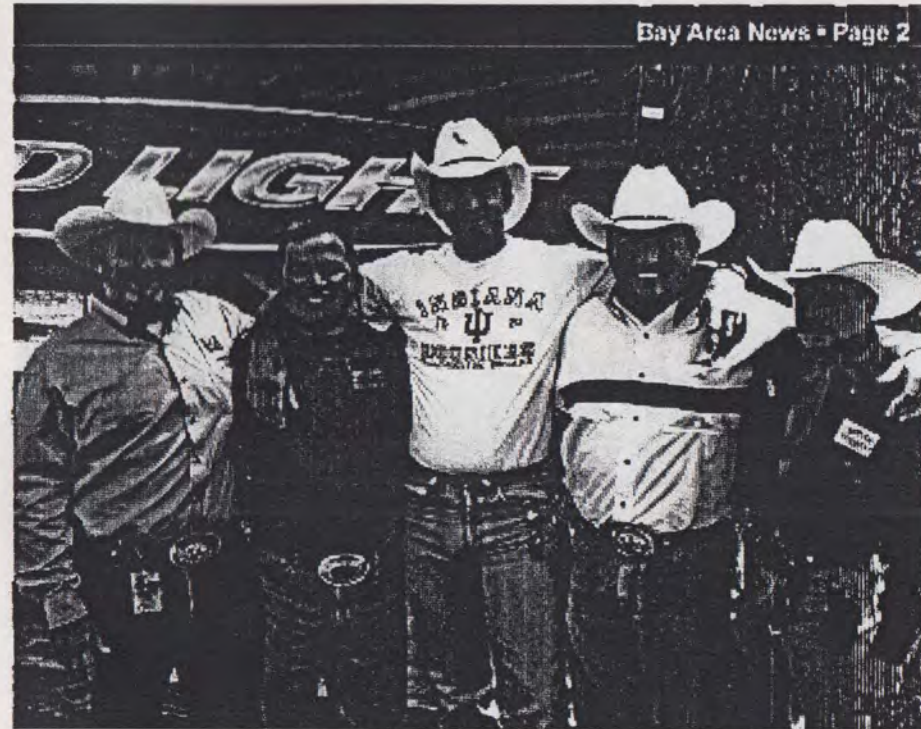
All 5 Presidents together at the "Best Buck in the Bay 2004"

To Be Determined after the Annual Meeting and the new BAC Board of Directors has been elected.