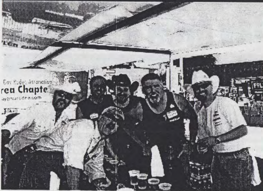
Getting ready to serve beer at Folsom Street Fair!!