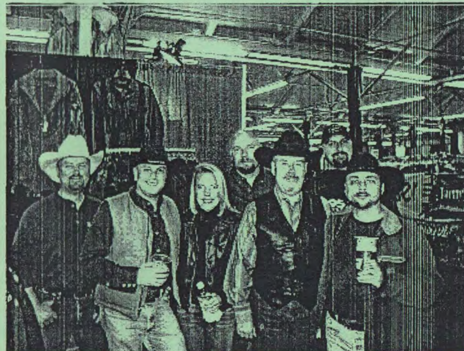
A bunch of Shop-a-holics at the Grand Nationals!