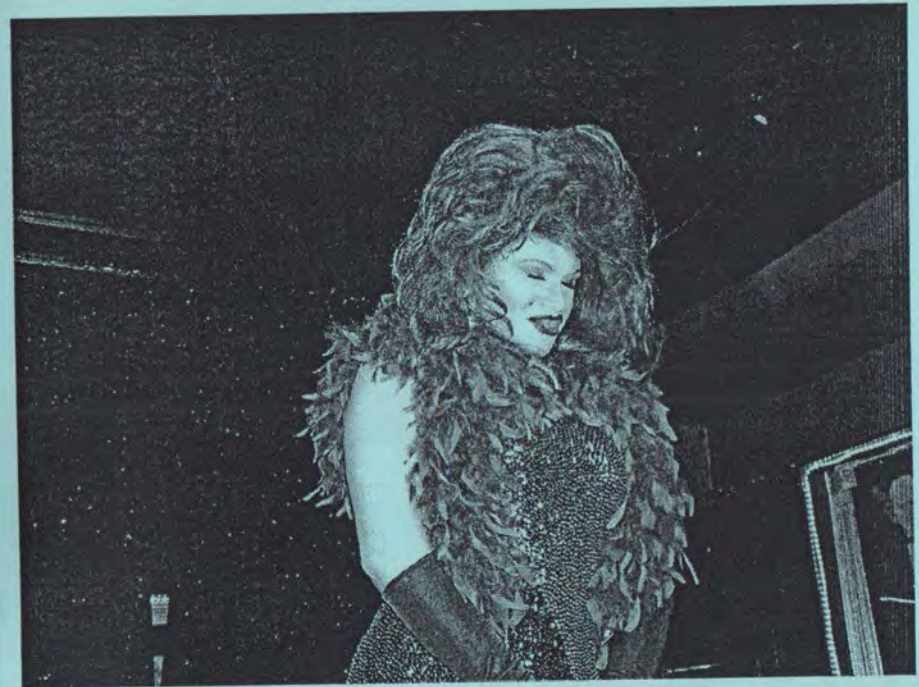
"If I close my eyes and click my heels three times, I WON'T be a drag queen any more.....I'll be a REAL girl"