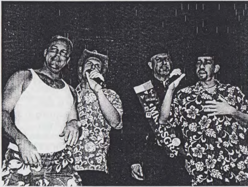
This is what happens when booze and microphones collide!