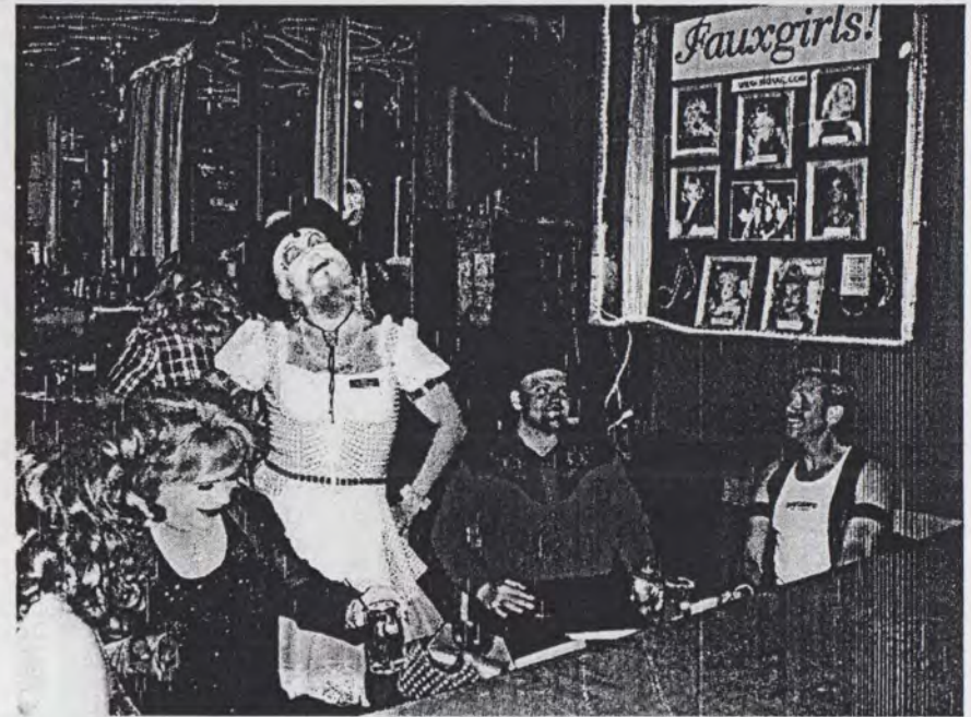
The Pageant judges "strike a pose" during the BAC Royalty competition!