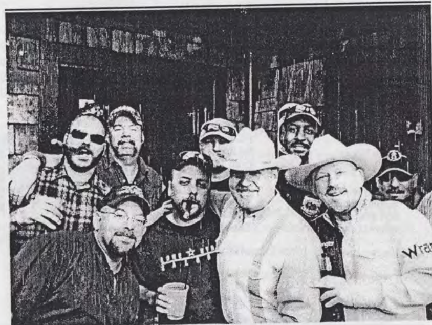
The gang at the Eagle Beerbust!!