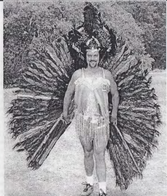
Now is this a drag outfit OR WHAT!!