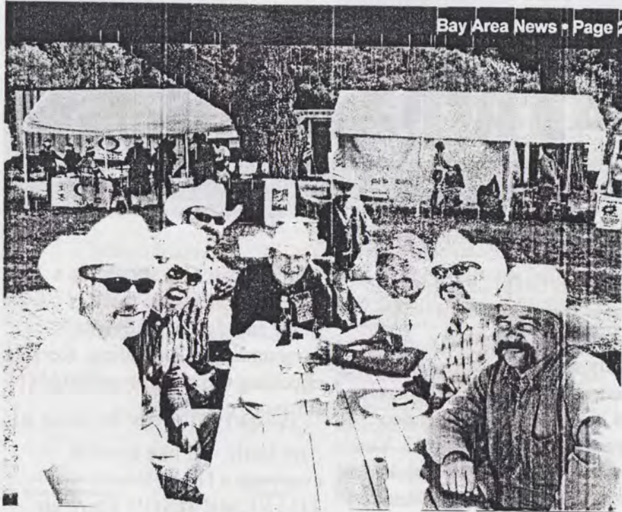
The gang having a burger and a beer!