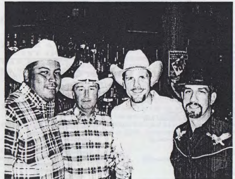
The gang hanging out in the Castro having a cocktail!