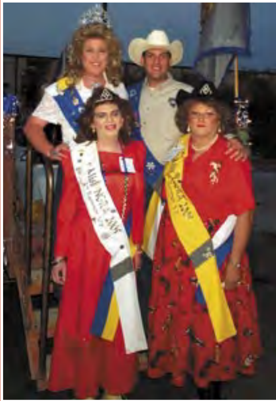
NGRA Sash Team at Pride Parade

The next IGRA Board Meeting will be held in conjunction with Chicago Rodeo on August 26-28, but I'll keep you up-to-date with news between now and then.