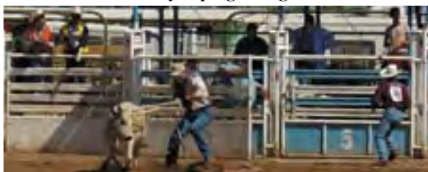
Steer deco at BigHorn Rodeo 2005