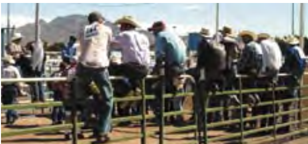
Line up of cowboys at BigHorn Rodeo '05