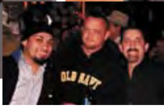
Country Fair at Badlands