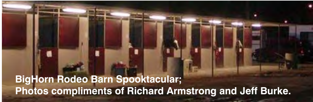
BigHorn Rodeo Barn Spooktacular