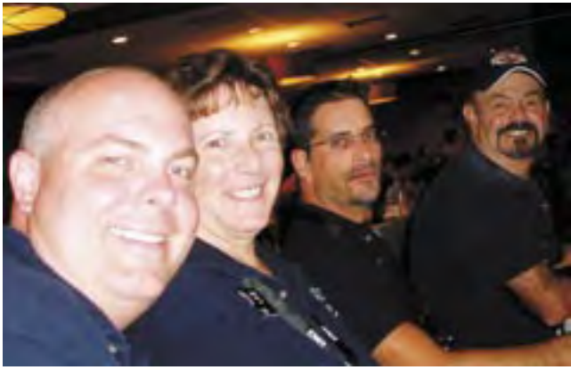
photos from the convention floor