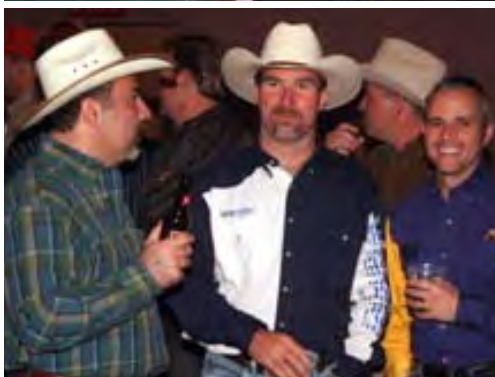
Members, Guests and Entertainers and the "Top of the Riv"