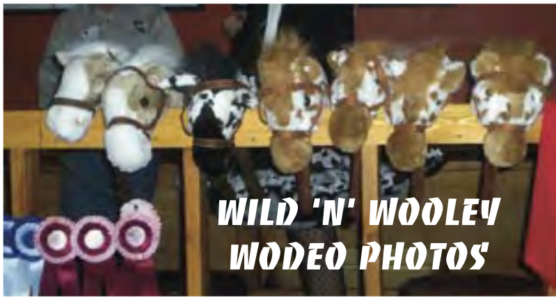
WILD 'N' WOOLEY WODED PHOTOS