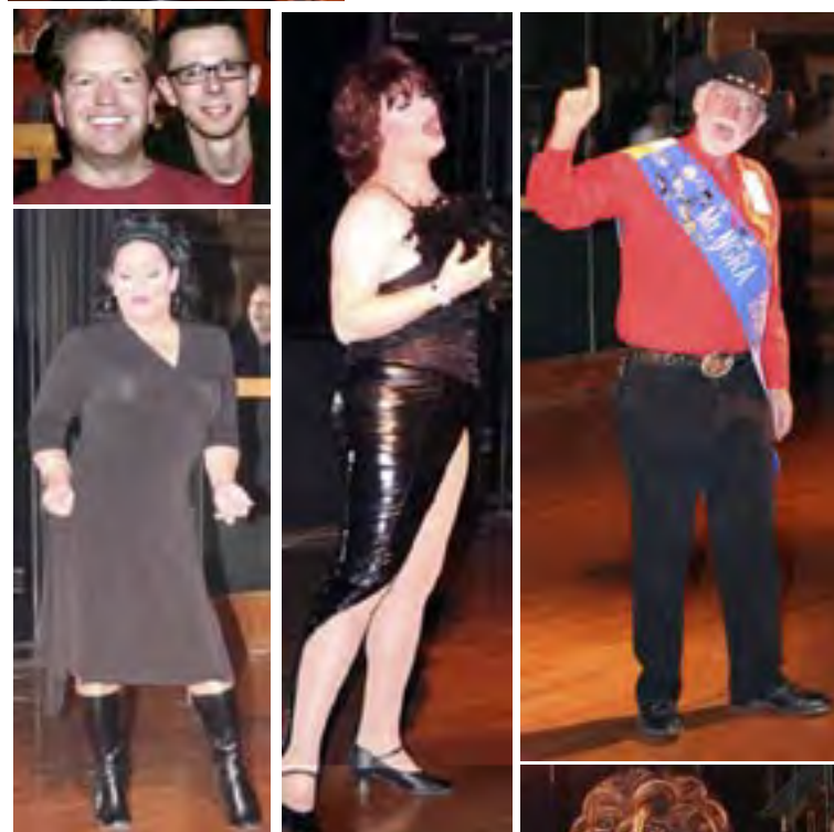
Photo taken at the BOD Show of members and guest. More photos on page 10