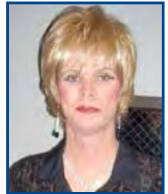
Miss NGRA 1st Runner Up 2008: