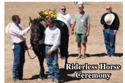
Riderless Horse Ceremony