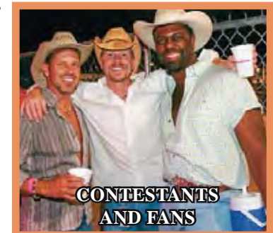
CONTESTANTS AND FANS