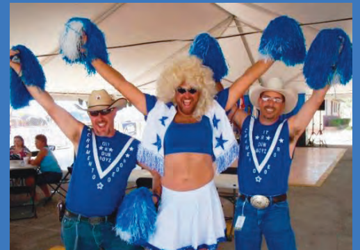
Sacramento Rodeo Raw-Rahs & The Git-R-Dun Boyz