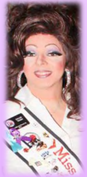
Miss IGRA 2012 2 nd Runner Up

Well that's about all I have for this month. Tune in next month when I recap my experience of A Texas Tradition Rodeo.