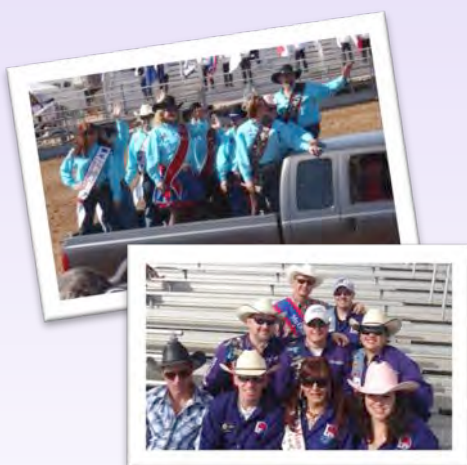
Above Left: Nine out of ten of the 2012 IGRA Royalty were in attendance at this years Road Runner Regional Rodeo.

During the 2012 IGRA Rodeo Season the IGRA Royalty Team would like to ask both spectators and contestants to wear the color teal on Saturday and the color purple on Sunday to show your support of their charitable partners; teal is for the National Ovarian Cancer Coalition and purple is for The Trevor Project and its "It Gets Better" Campaign.