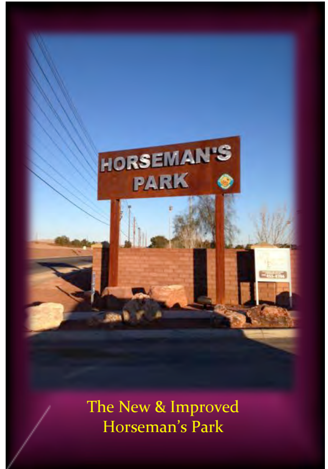
The New & Improved Horseman's Park