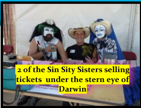
2 of the Sin City Sisters selling tickets under the stern eye of Darwin