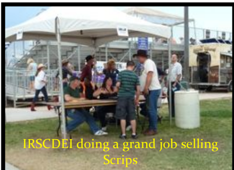
IRSCDEI doing a grand job selling Scrips