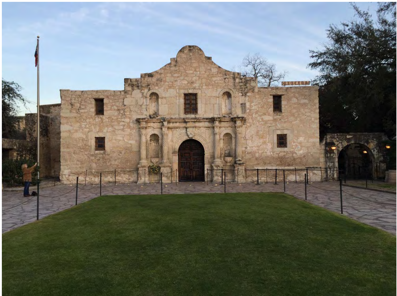
The Alamo Mission, San Antonio

IGRA University 2015 San Antonio, Texas, January 16 - 18