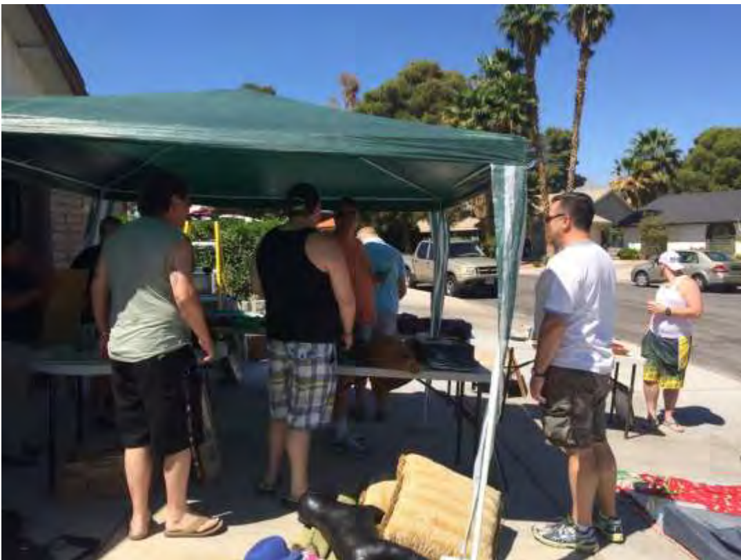
This retail extravaganza raised $384 towards the Gold and Silver Rush Days at BigHorn Rodeo. Well done to all involved for supporting this good cause.