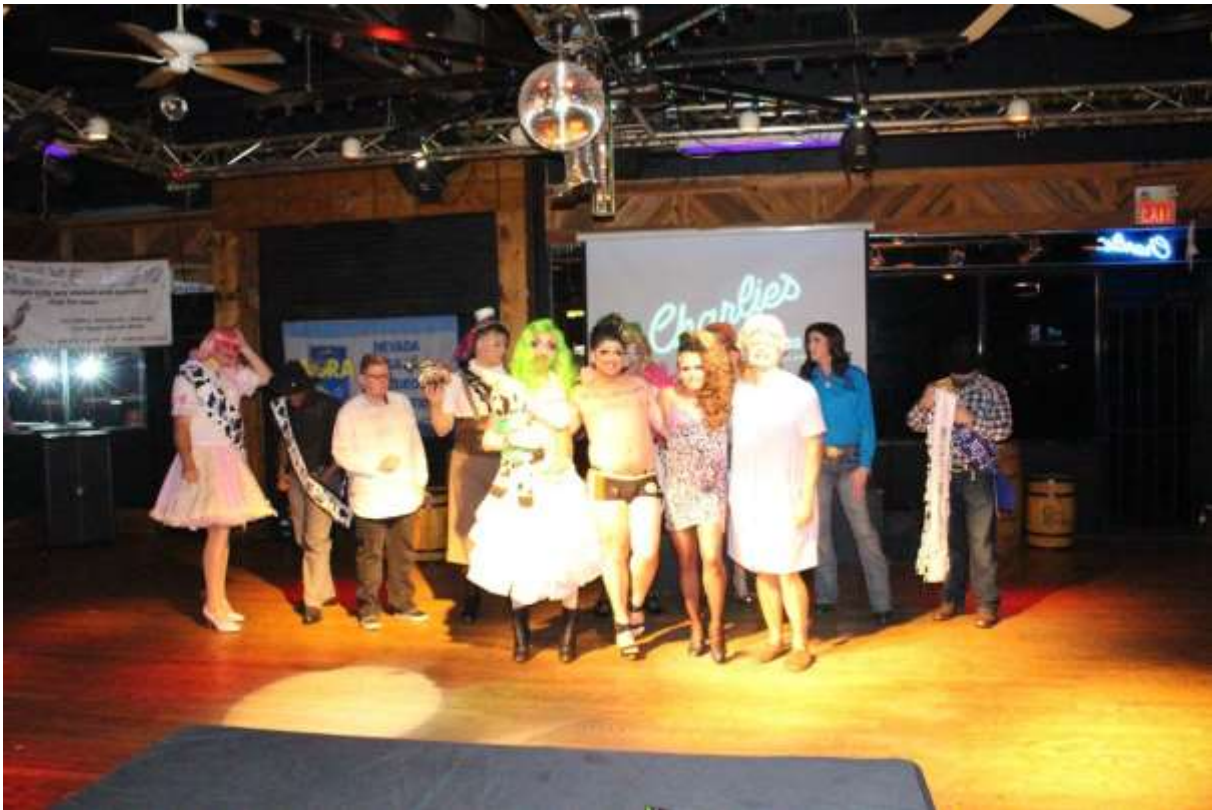
Background - Former Miss Cow Patties Foreground - Miss Cow Patty 2015 Contestants