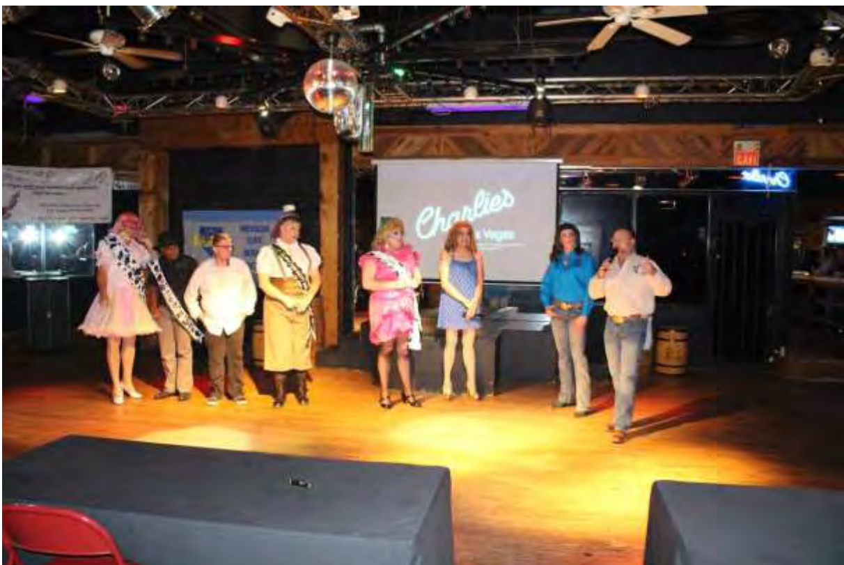
Announcing the Results