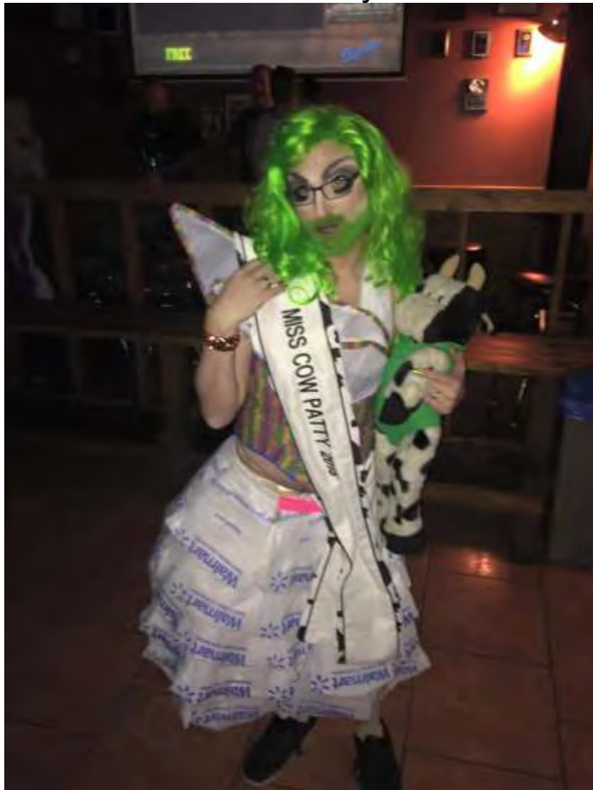
Miss Cow Patty 2015