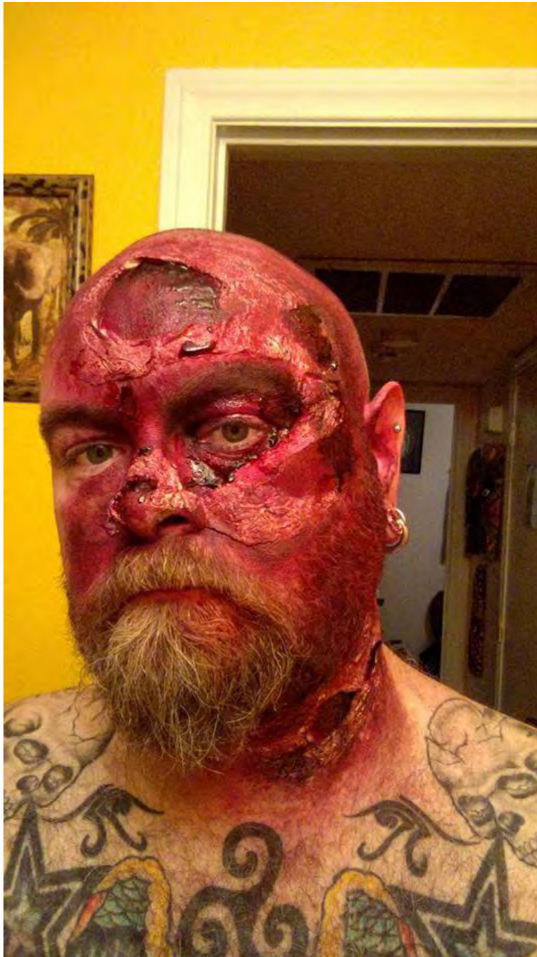
Dawg certainly captured the spirit.

As all the bars got out the skeletons, witches hats and spider webs NGRA got in the mood by asking you to capture the mood of Elm Street as it passed through Charlie's.