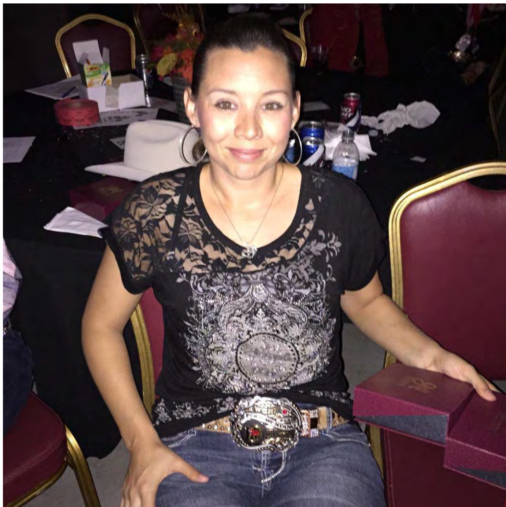
Proudly wearing her WGRF Buckle for Pole Bending