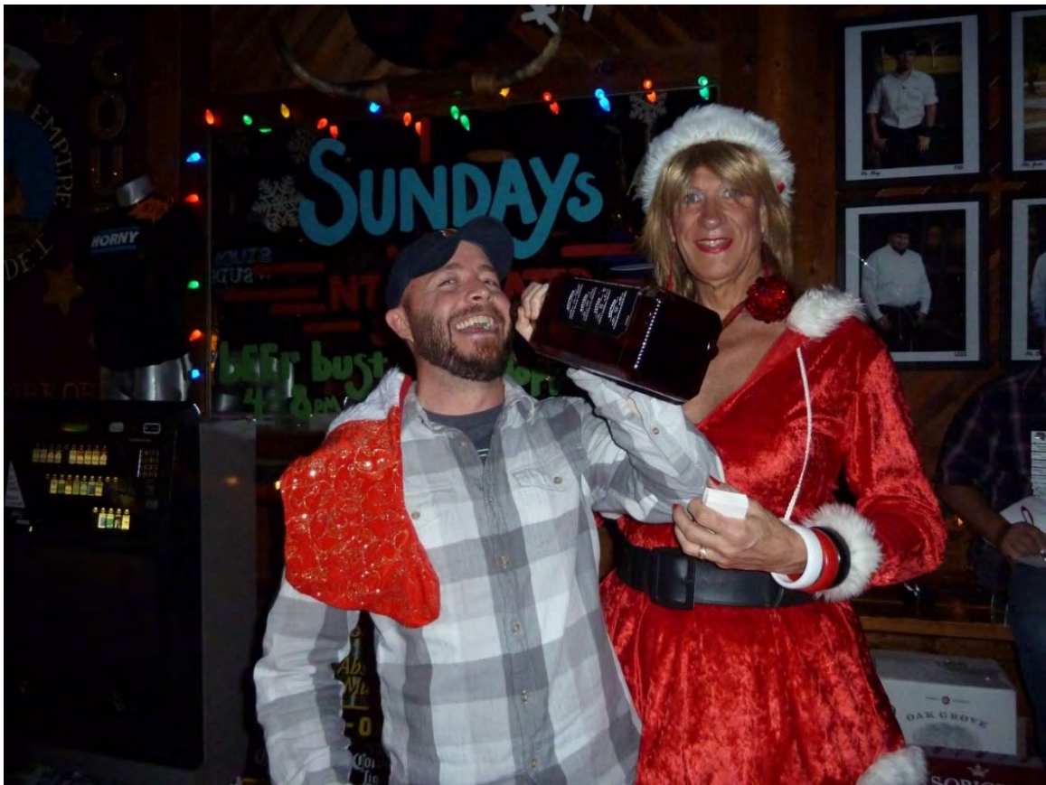
Miss Kitty in festive wear with another happy multiple winner.