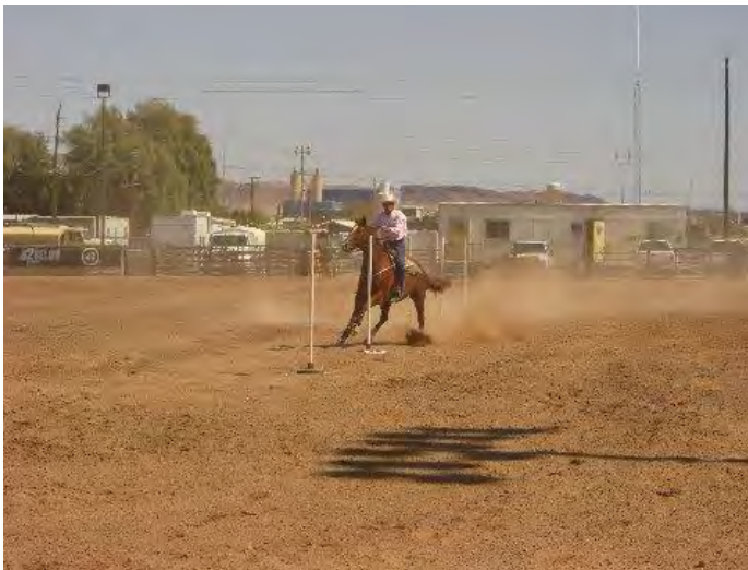
Nickel – Poles (Bighorn Rodeo 2008)