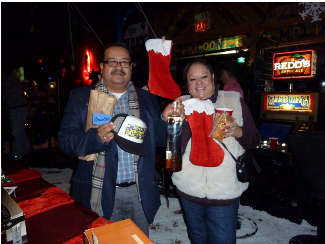
Some people just could not stop winning and smiling the night away.