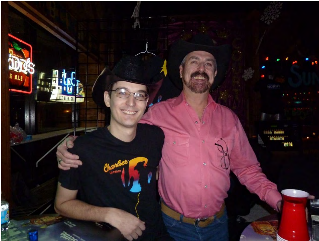
One of our sexy cowboys selling the beer bust and cosying up to the bar staff whose support we always appreciate.