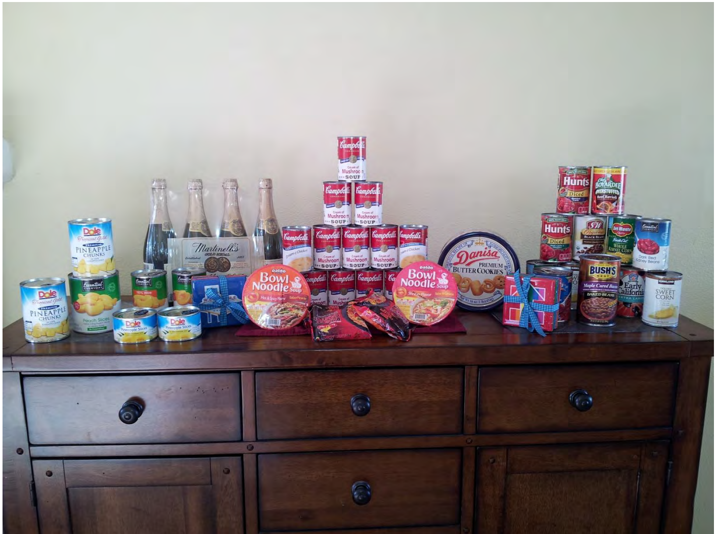
The food items we collected for St Therese.