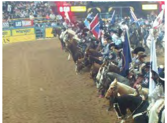
Diamond NFR Grand Entry