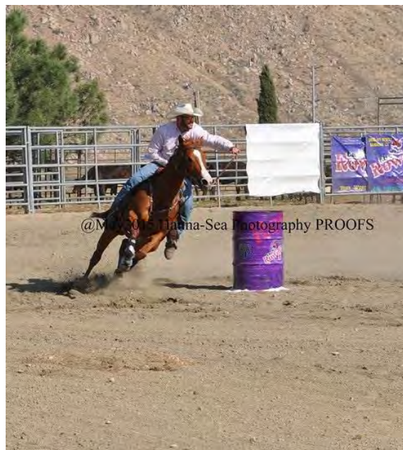
Olive – Barrels (Palm Springs 2015)