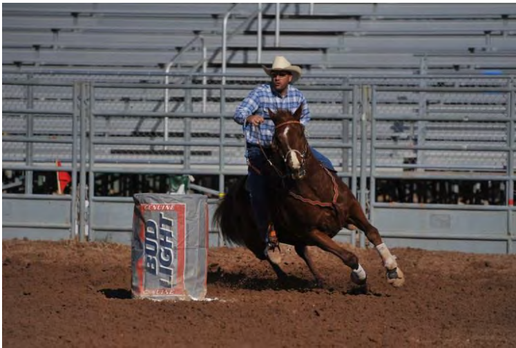
Cash – Barrels (Phoenix 2010)