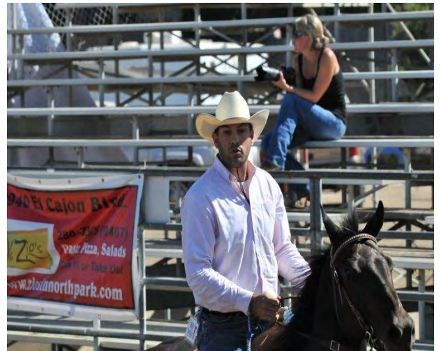
Diamond – Flags (San Diego 2010)