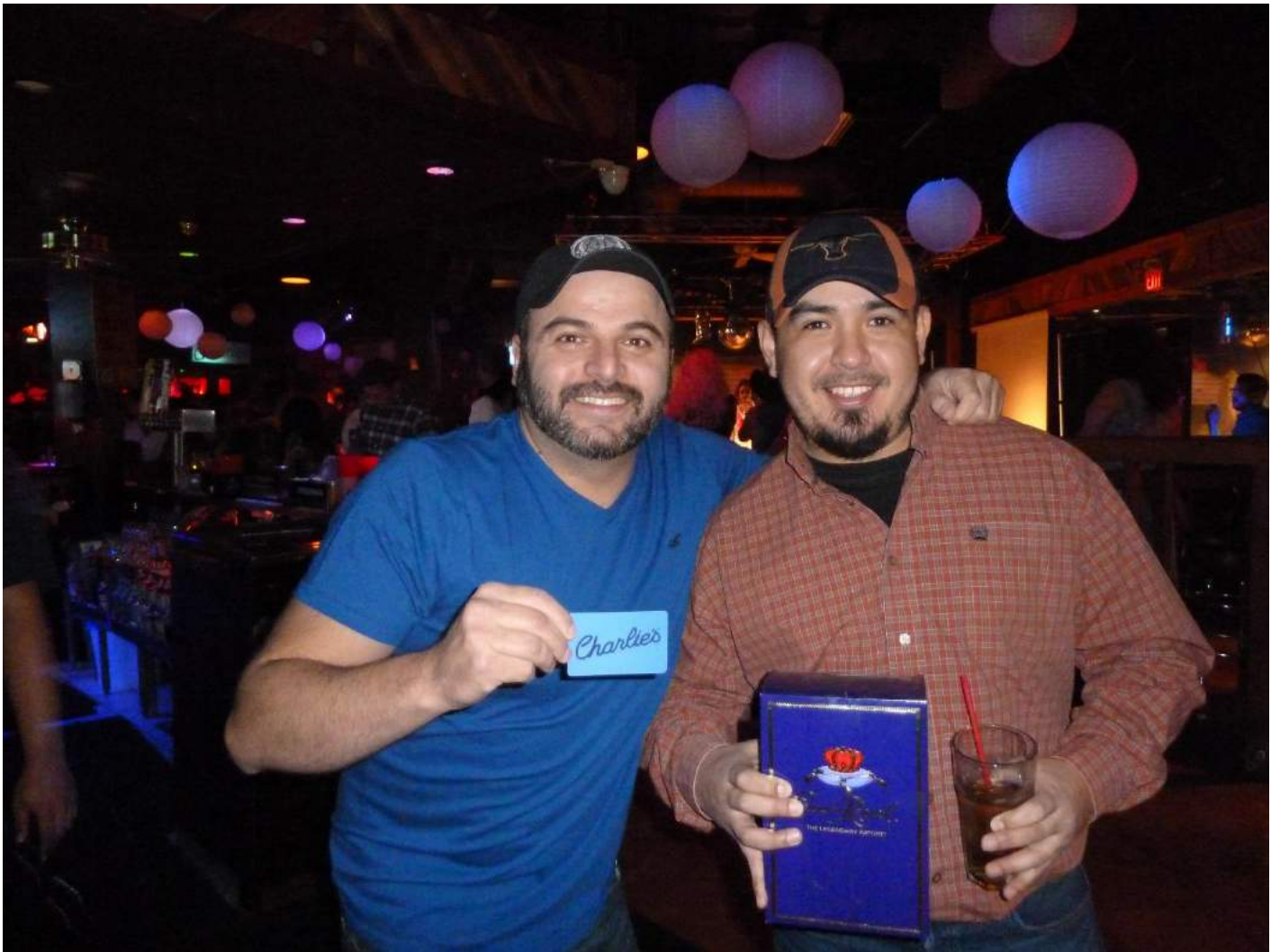
Well Crown Royal makes a change from vodka and now they can go and use that Charlie's bar tab to make sure they have a really great night.