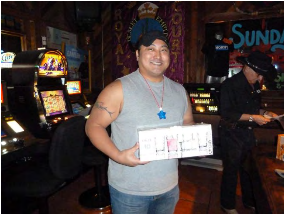
Well no vodka for this guy but this smiling winner at least has the glasses if he wins some in February.