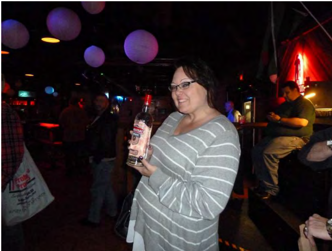
Well this lady got one of the bottles of vodka that were up for grabs.