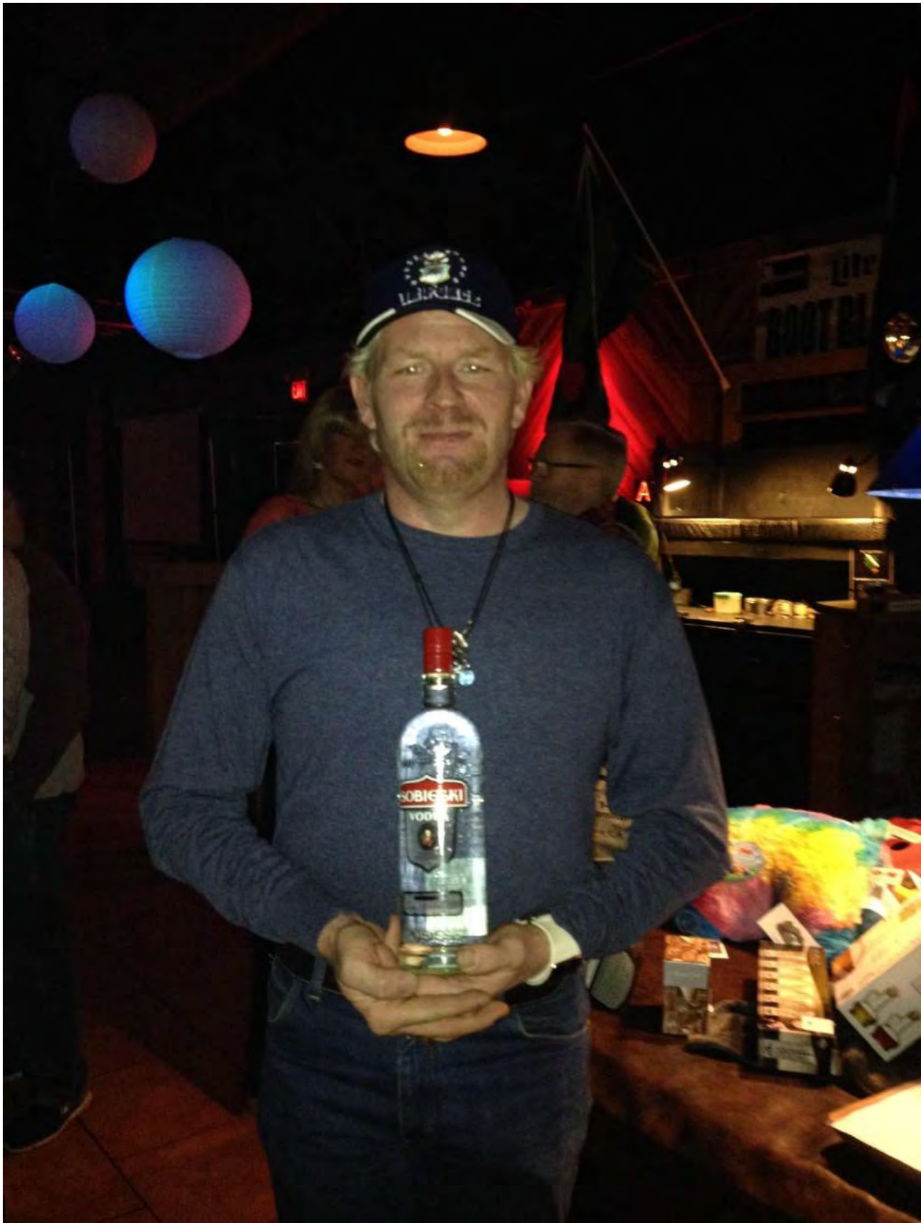
And another vodka winner.