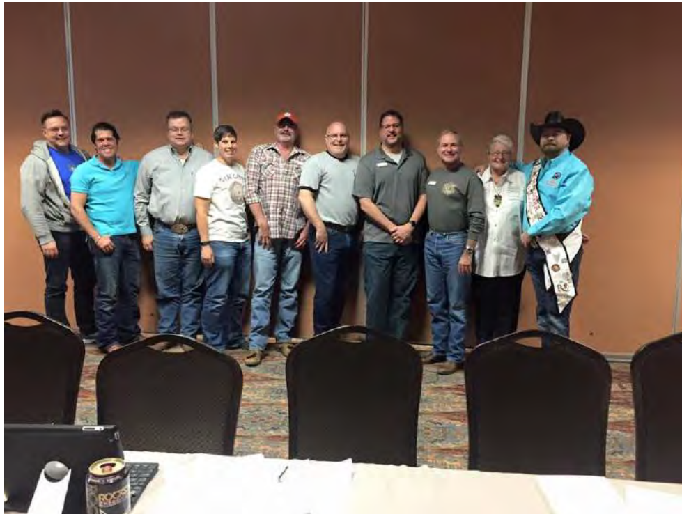
My Rodeo Production class. Thank you all for making it special