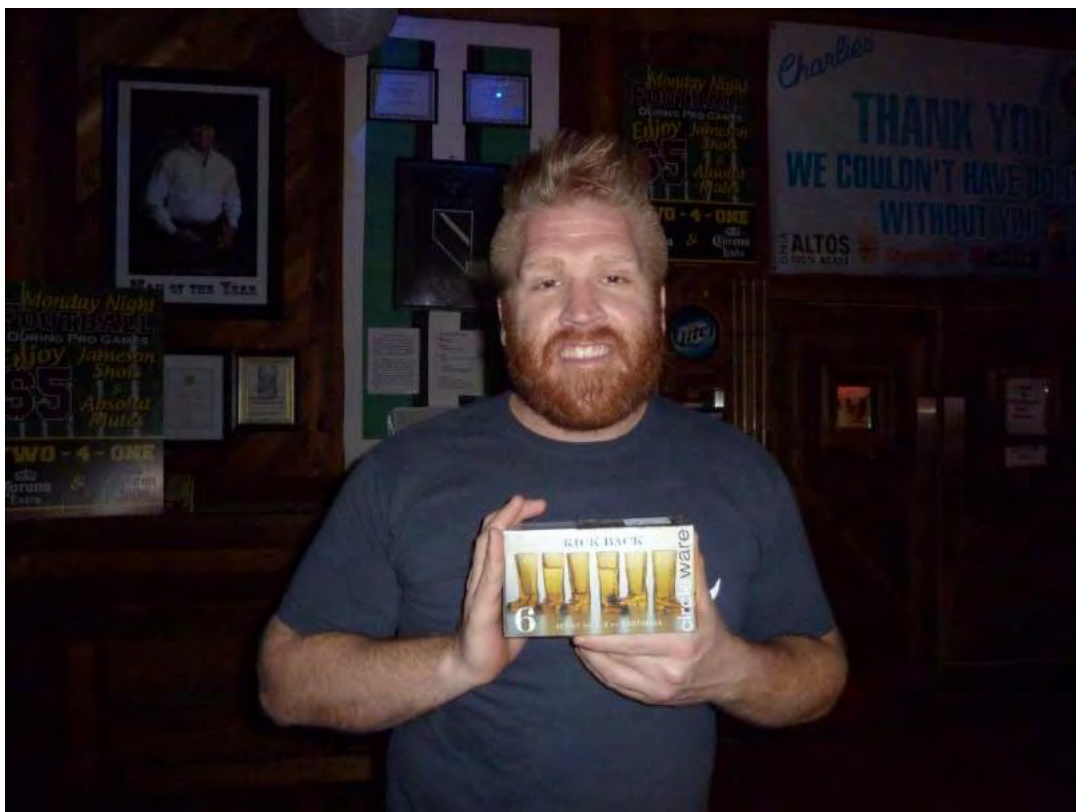
This chap walked off with the lovely cowboy boot shaped shot glasses. I really like these but they are hard to find.