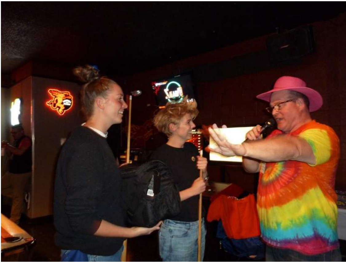
Two keen pool players won a bag filled with Rockstar to keep them going through the night.