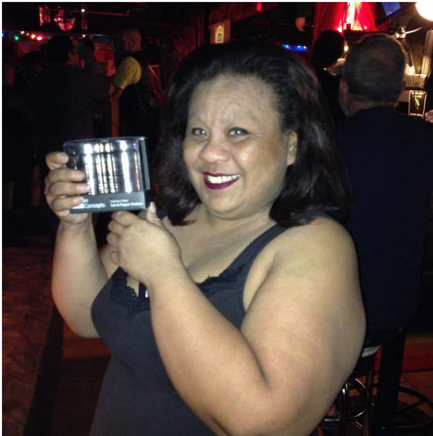
Gallery of some of our Guests