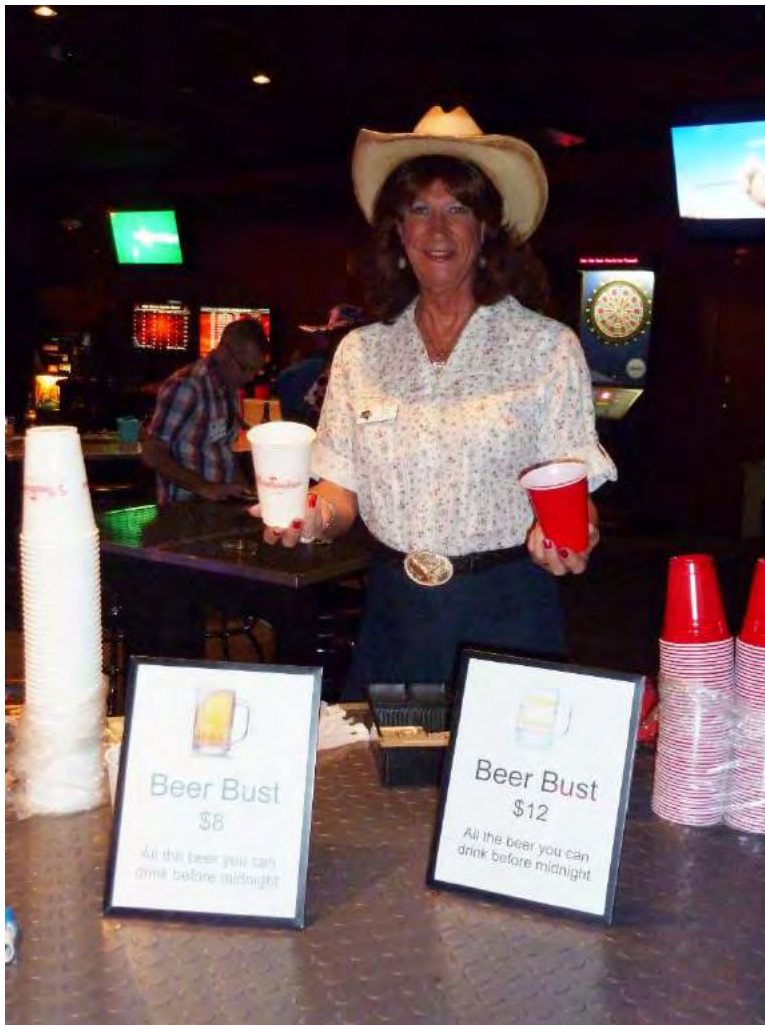
Two of your Board Members enticing patrons to part with their money as they entered the bar and buy a Beer Bust.