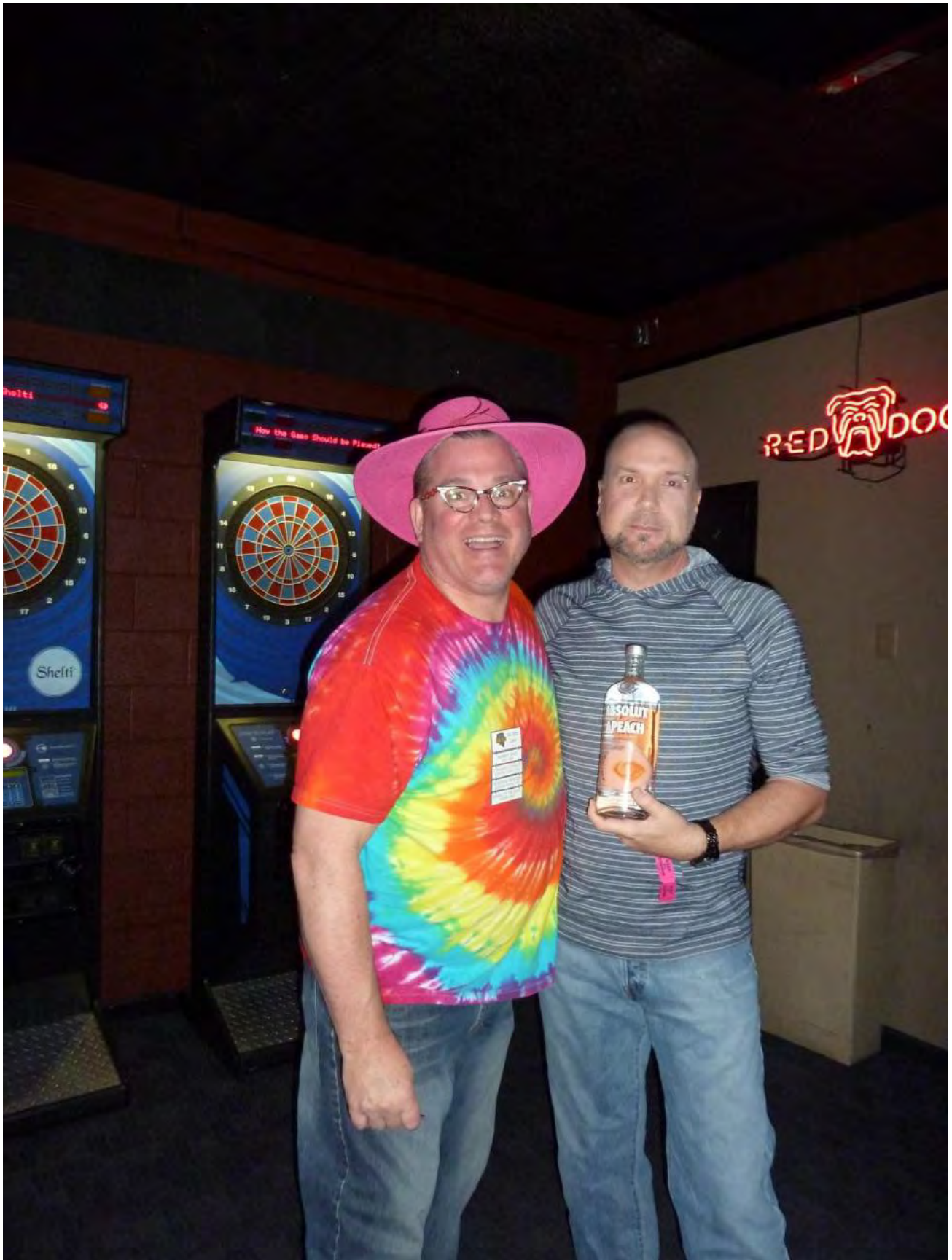
Winning this bottle, another gift from the bar, one might have thought this chap would look happier