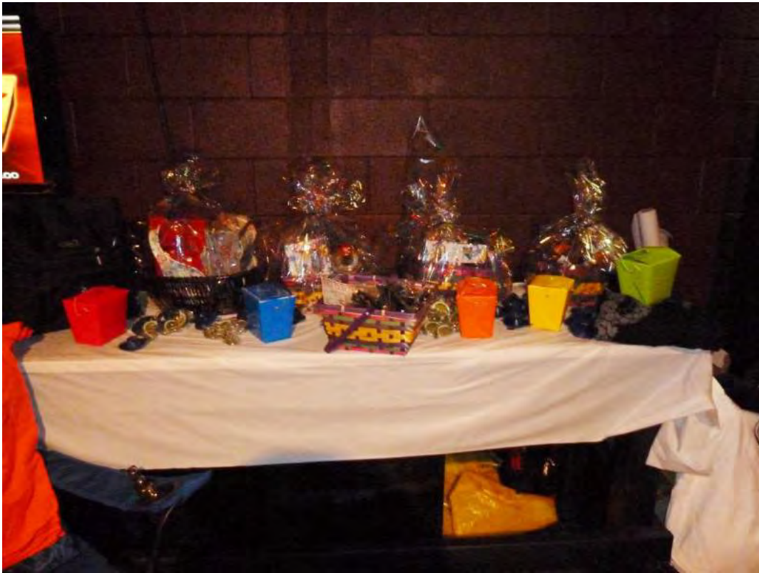
The Fundraising Team compiled a wonderful selection of prizes for the Raffle.