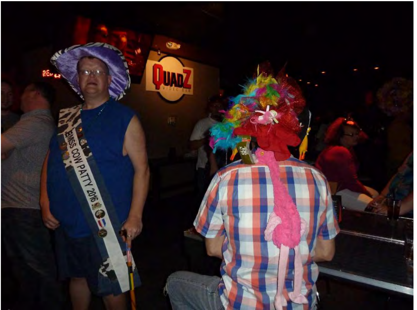
Our new Miss Cow Patty 2016 proudly wearing the very smart sash. And the back of the What the Hell category stunning entry.