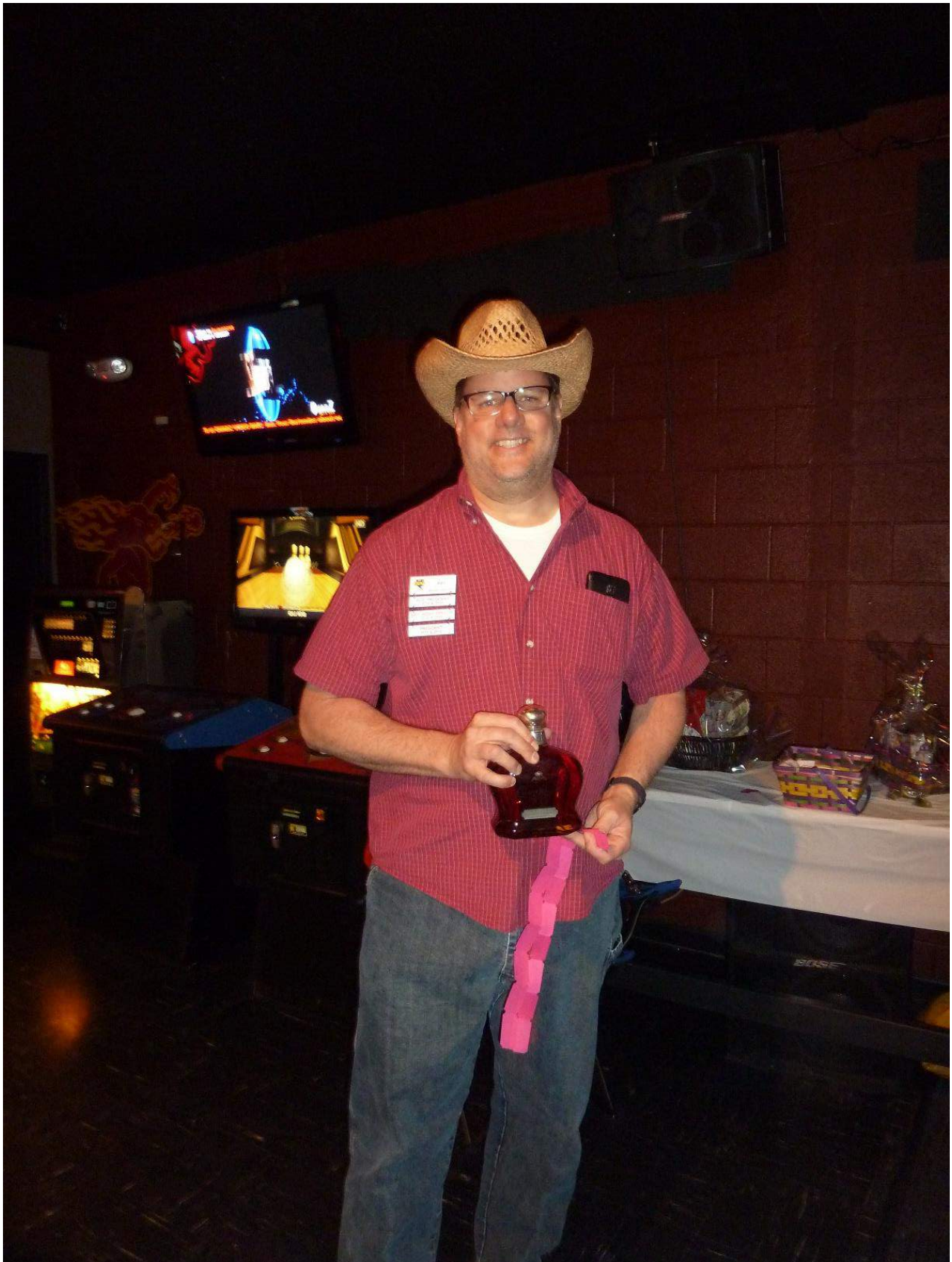
Back in his more normal, comfortable hat, this prize, a gift from Quadz, made up for the embarrassment of that red queen hat worn earlier.