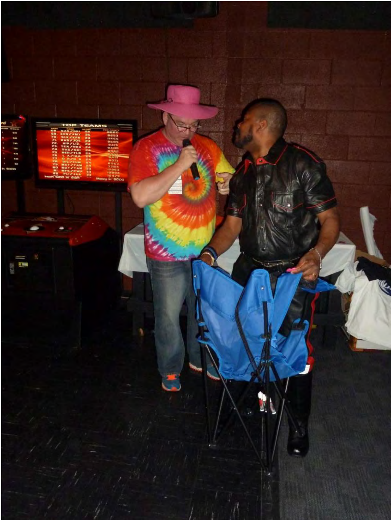
Just in case the bar stools weren't comfy this lucky patron walked out with his own folding chair.