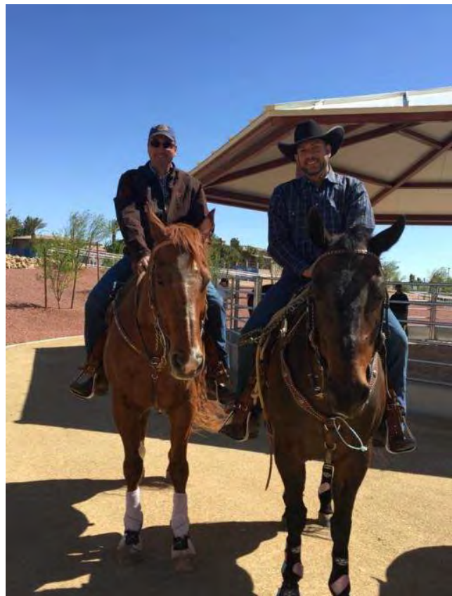
Grand Opening, Lone Mountain Equestrian Park and Trail