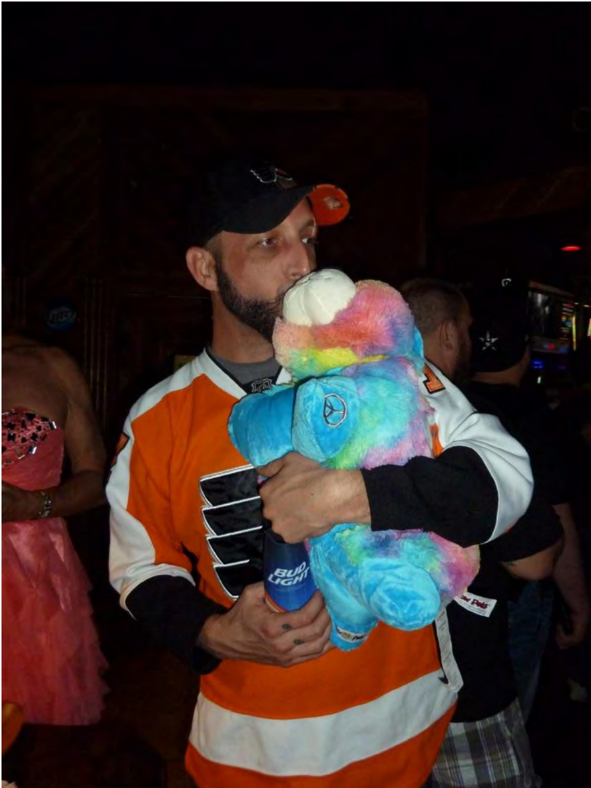
Peace bear is a well-loved favorite prize