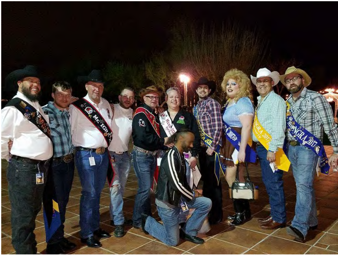
Different Royalty Members at AGRA Rodeo