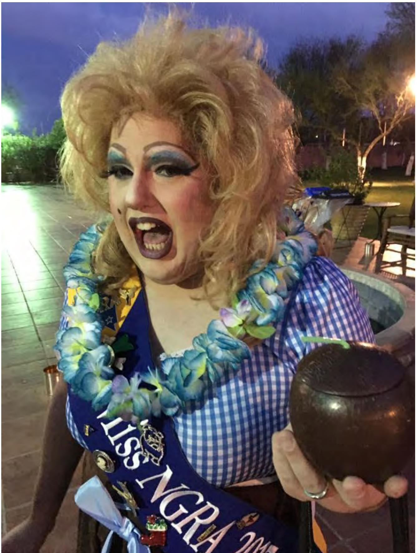
Phat Patty was taken to Hawaii by the AGRA Royalty at AGRA Rodeo