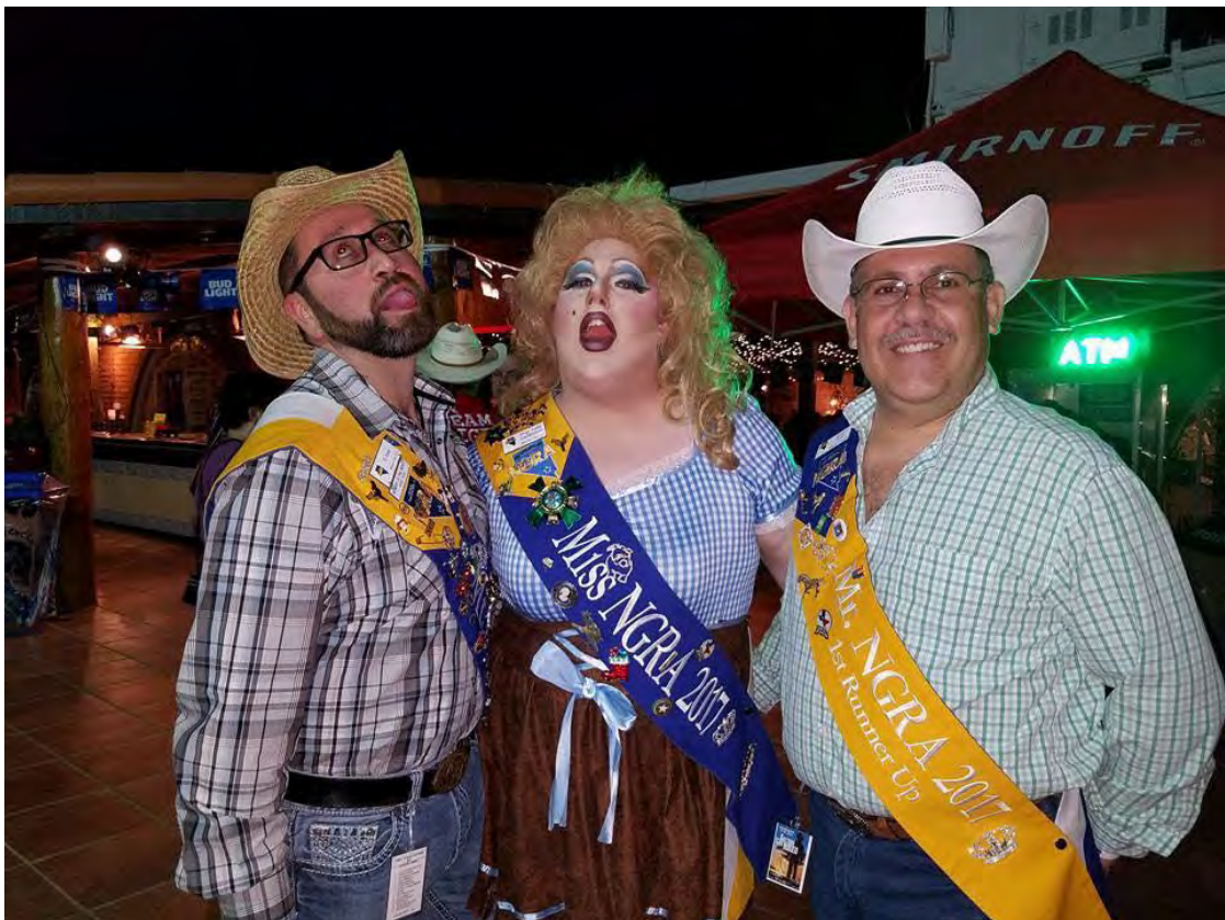
Being Goofy at AGRA Rodeo