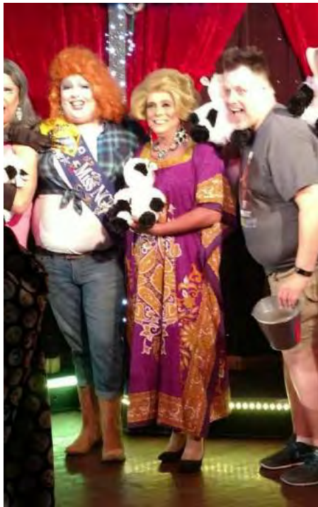
Some of the MuMu winners