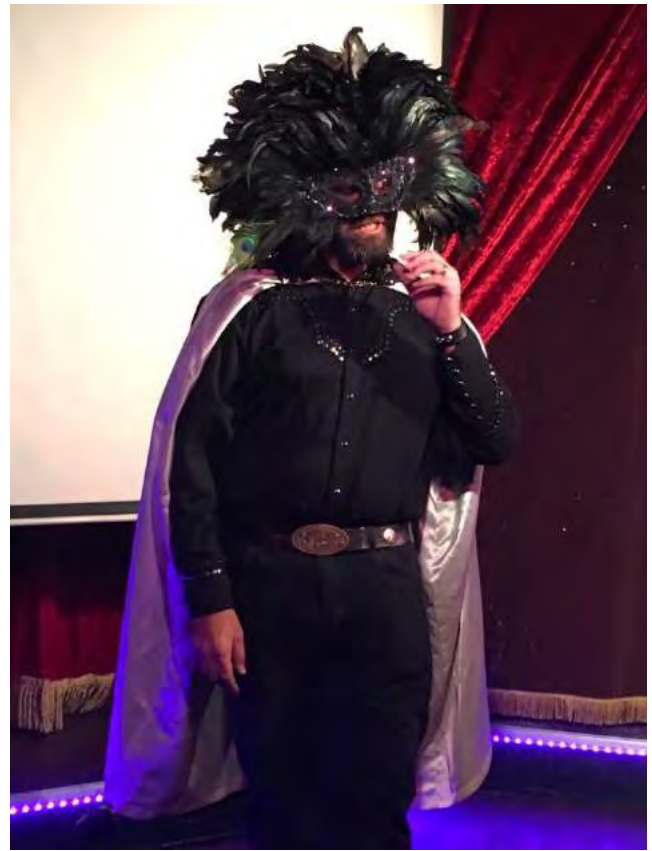
B-Bear bring some Phantom