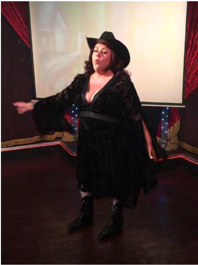
Ms AGRA 2017 performing