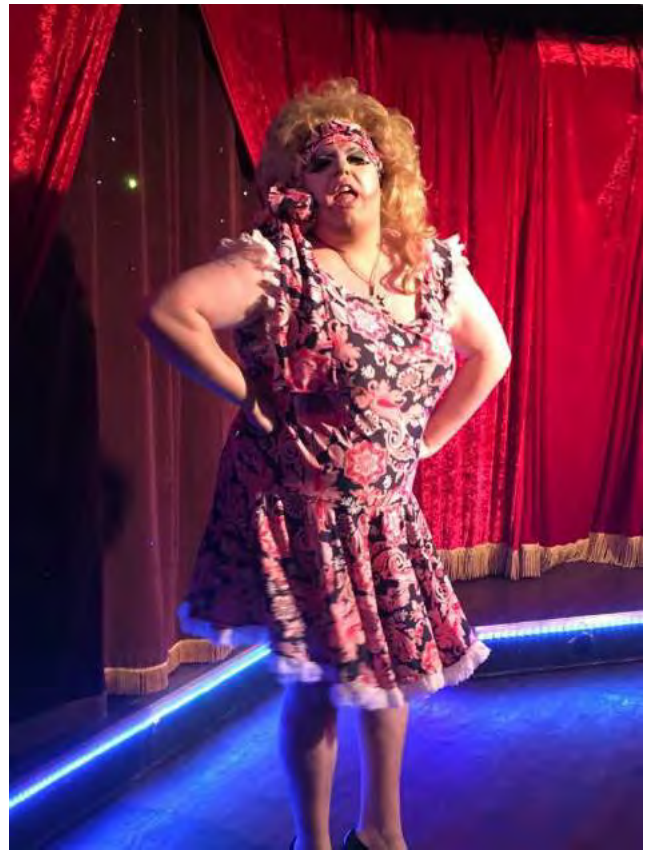
Phat Patty performing from Oklahoma