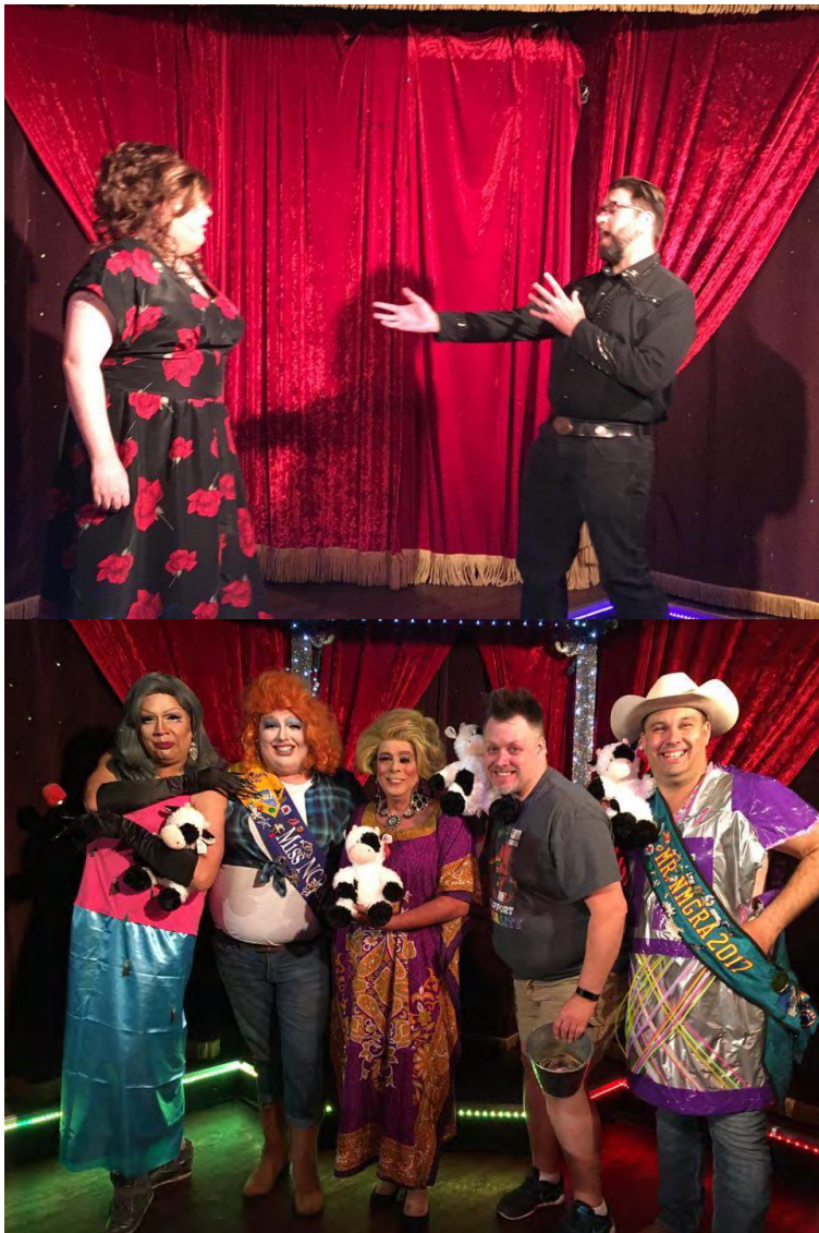
June is Bustin' out all over for NGRA