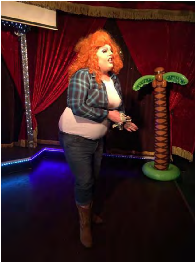
Country Aint Never Been Pretty