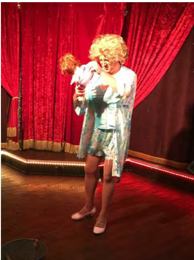
Felinda Bush performing