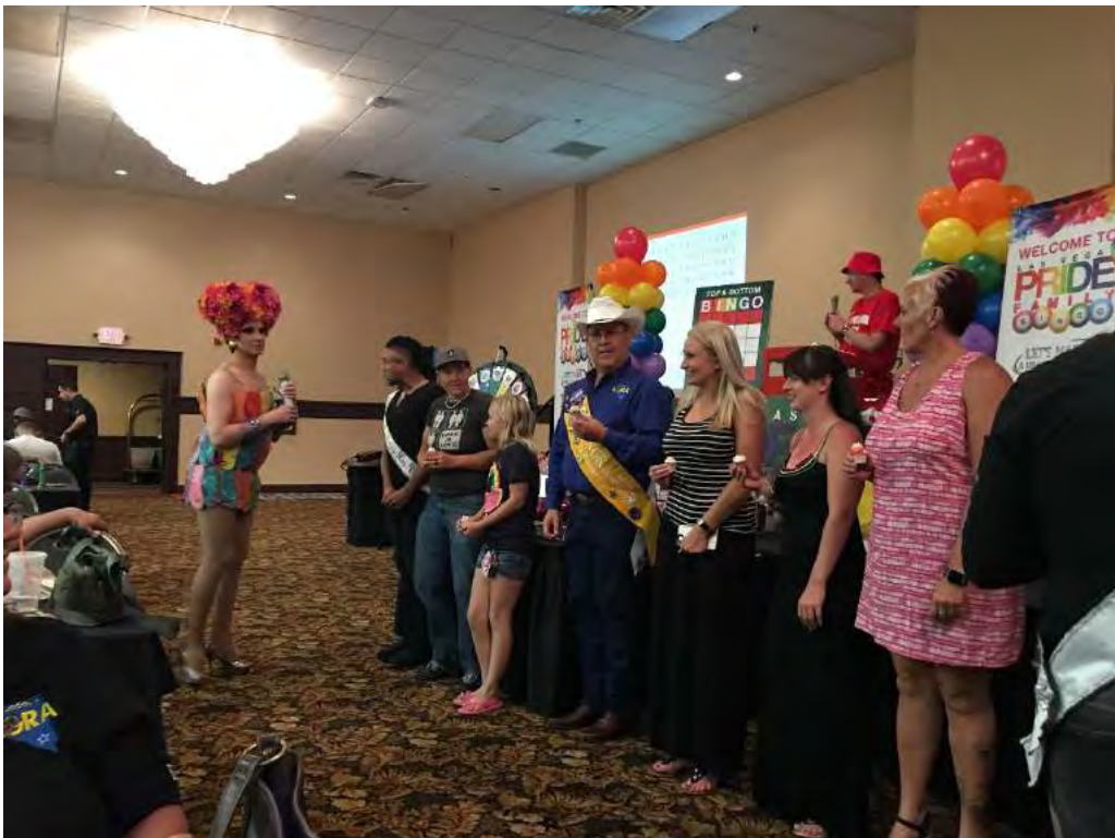
June Birthday Celebration