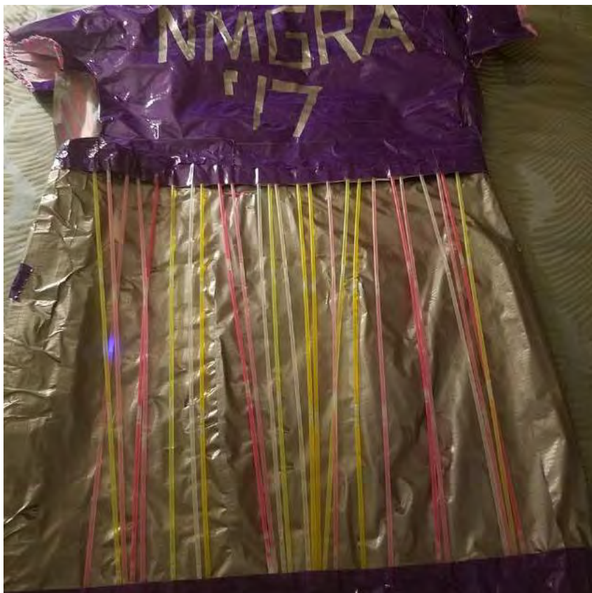
The back of Tre's MuMu