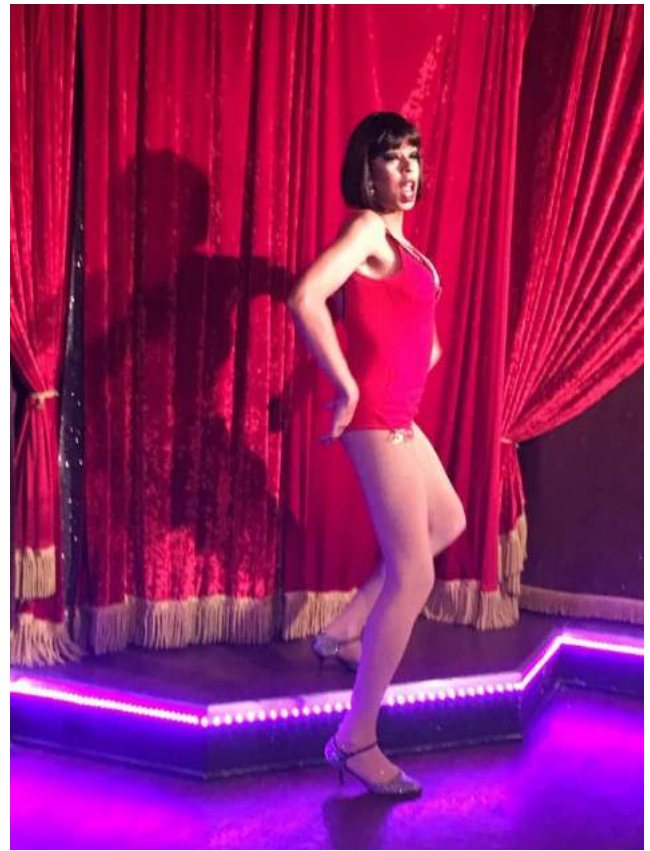
Fantasia at it again