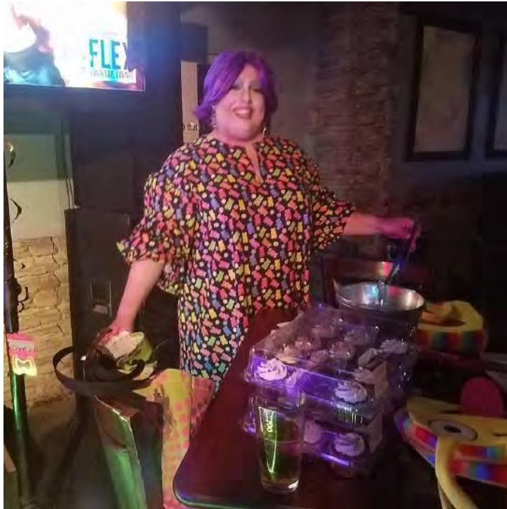
Patty getting ready to start the Party!