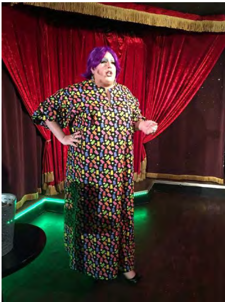
Phat Patty opening the MuMu Party