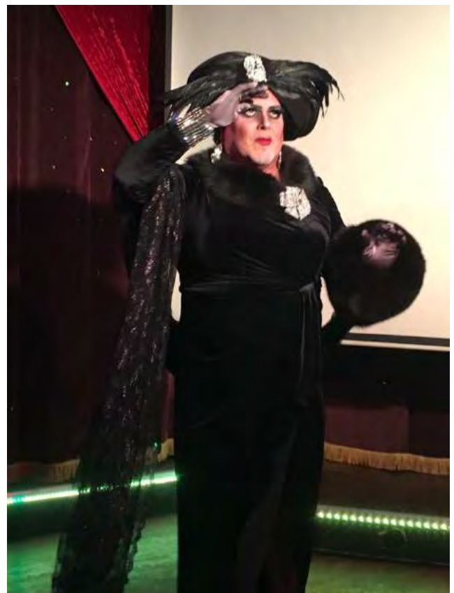
Norma bringing some Norma Desmond