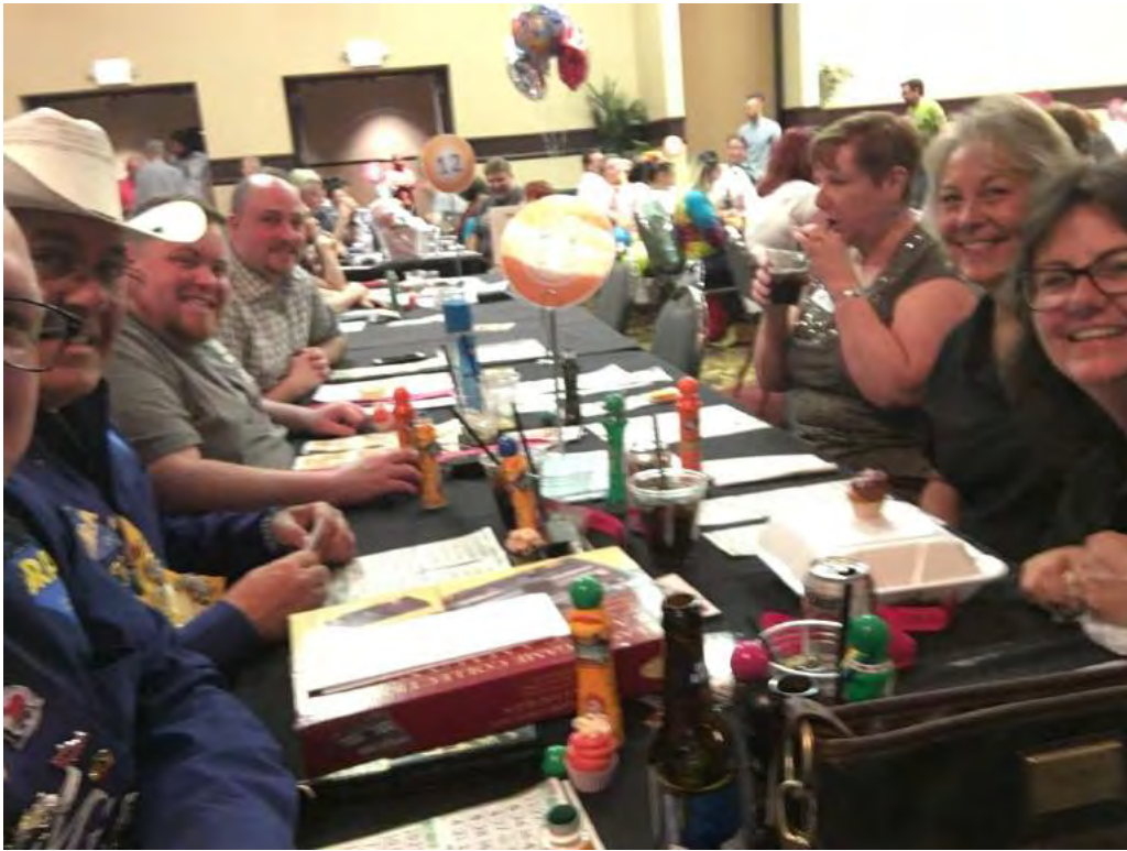
NGRA at Pride Bingo

Then we had a nice group at Pride Family Bingo.