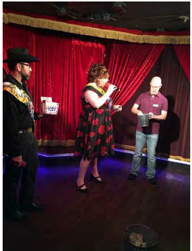
Thanks to Gene Dockins for selling raffles