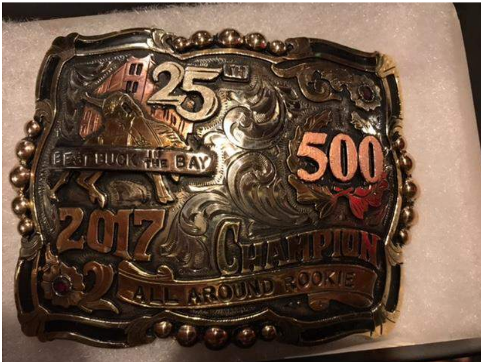
Matt's Rookie Buckle