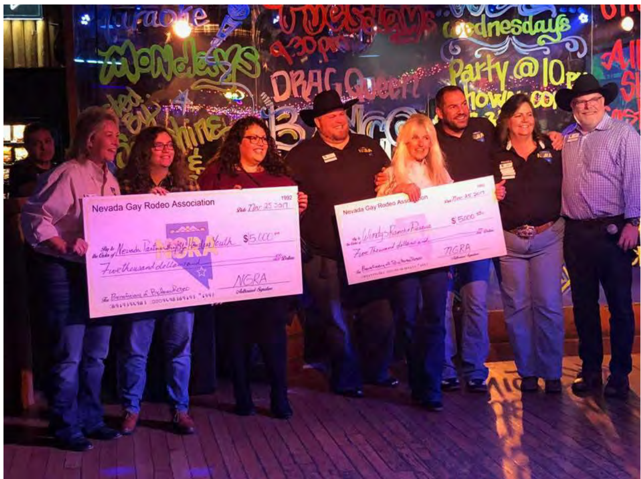
Presentation of Checks to Nevada Partnership for Homeless Youth and Windy's Ranch & Rescue