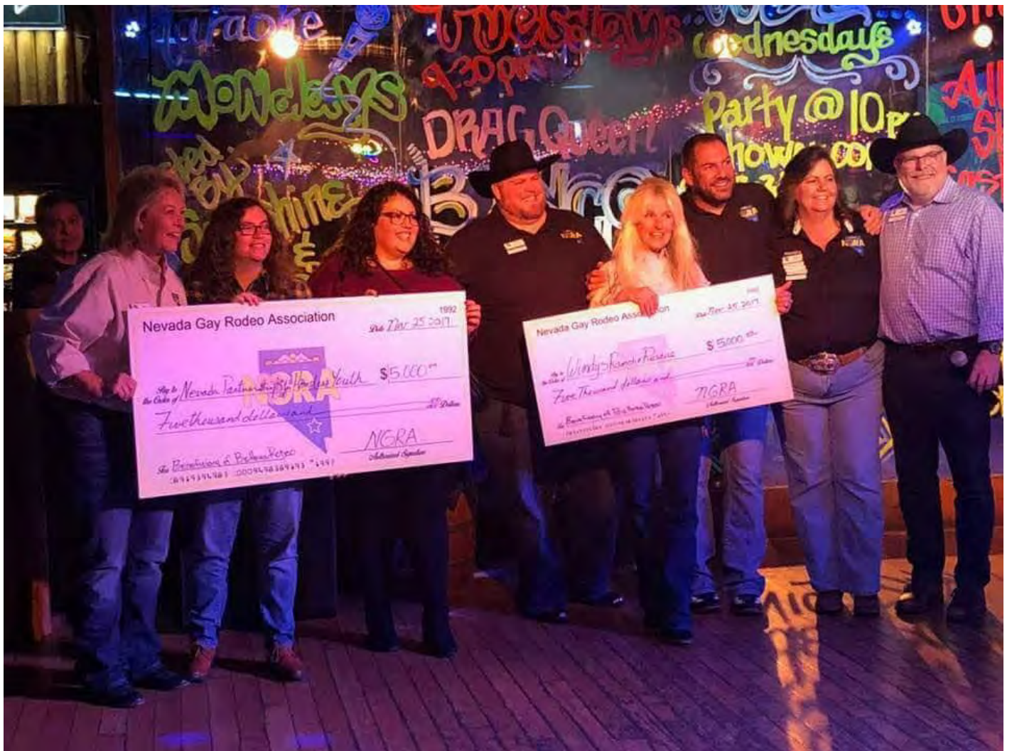
Presentation of Checks to Nevada Partnership for Homeless Youth and Windy's Ranch & Rescue